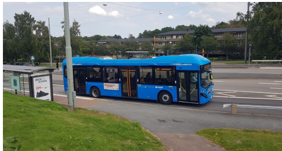
A Volvo electric hybrid bus on the streets of Gothenburg.

It is here in the cold north that Volvo has been thriving for decades, developing vehicles renowned for their safety and comfort. Over the course of the past few years, some of their buses powered by electricity have made their way to the market as well. Their electric hybrid double-deckers driving down the streets of London are estimated to produce between 30-40 percent lower carbon dioxide emissions compared to a conventional vehicle. Somewhat closer to home, their fully electric buses have been in use on line 55 in Gothenburg since 2015.